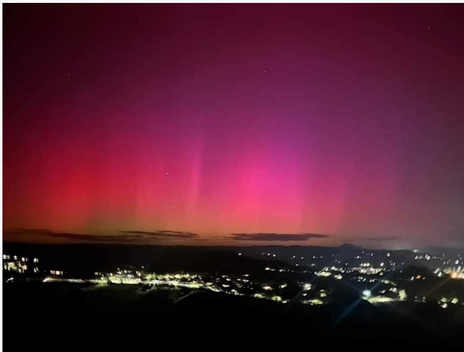
from Hillcrest Lookout, Whakatāne

Did you see the stunning aurora lighting up the skies in New Zealand this last week? It was a truly awesome spectacle to see something so beautiful in our vast skies.